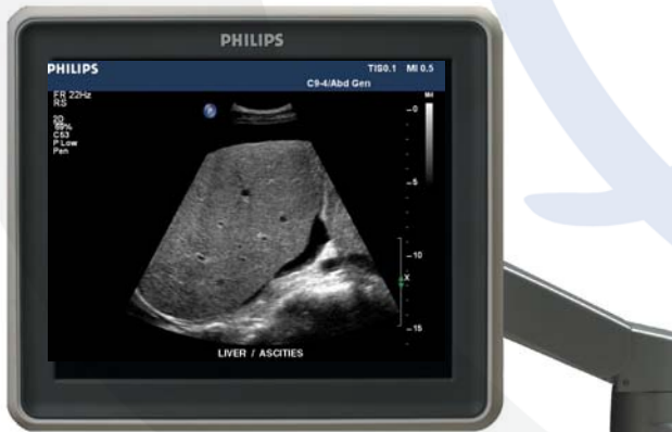
Figure 1. Longitudinal scan of the liver revealing a mild ascites (free abdominal fluid).

In 1880, the brothers Jacques and Pierre Curie demonstrated the piezoelectric effect which makes possible the generation and detection of high-frequency pressure waves. The ability of a piezoelectric crystal to emit ultrasound as a beam in a predetermined direction and to detect the echoes reflected from objects struck by the beam, was first exploited in World War I in the detection of