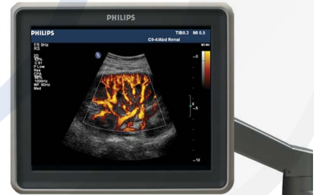
Figure 3. Longitudinal scan of a kidney using power Doppler to demonstrate blood flow through the renal vasculature.

The Doppler effect was first described by the Austrian mathematician and physicist, Johann Christian Doppler (1803-1853). In his famous article of 1842, he describes how the phenomenon affects the observed light waves from stars having a movement relative to the observer. If the star is moving towards the observer, the frequencies of the observed light waves are slightly higher than the emitted frequencies, and vice versa. The change in frequency can be used to estimate the speed of the star relative to the observer. This