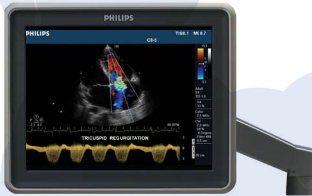
Figure 2. Cardiac scan using color flow Doppler and Pulsed wave Doppler in duplex mode to demonstrate tricuspid regurgitation.

enemy submarines. This technique was later developed into the well-known SONAR (sound navigation and ranging) system. The first published attempt to use ultrasound for medical diagnosis did not appear until 1942, when K.T. Dussik tried to use transmitted ultrasound through the intact skull to diagnose brain tumors. The attempt was, however, unsuccessful. In 1949, G.D. Ludwig and F.W. Struthers authored the first publication on the use of the pulse - echo technique for medical diagnostic imaging.