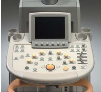
Advanced Veterinary Medical Imaging's new Philips iU-22 ultrasound system.

The fact that the Doppler frequency shift could be used for the detection of blood velocity patterns, was shown in 1959. And the first combined use of standard (B-mode) ultrasonography and pulsed Doppler velocity detection, introducing the term duplex scanning occurred in 1974. Color Doppler sonography with its color coding of blood flow velocities, was introduced in the 1980s, followed by power Doppler sonography in the early 1990s.